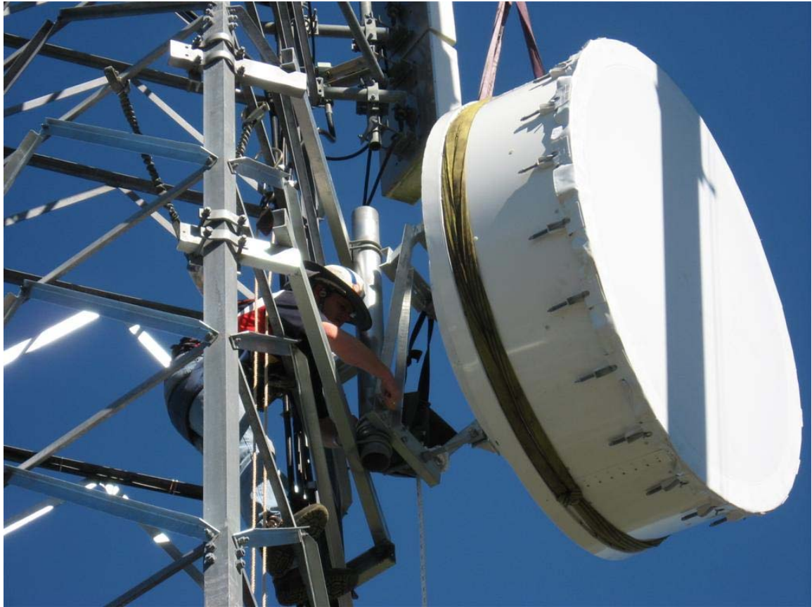
Installation of one of the main microwave antennas